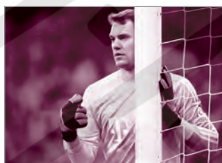
6. Manuel Neuer 3/27