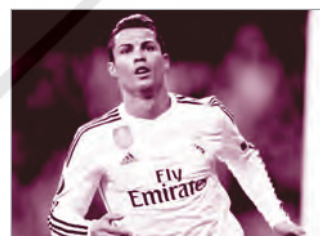
8. Cristiano Ronaldo 2/5