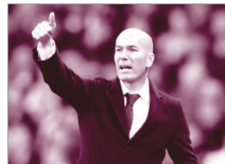
4. Zinedine Zidane 6/23