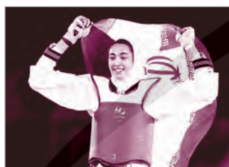
5. Kimia Alizadeh 7/10