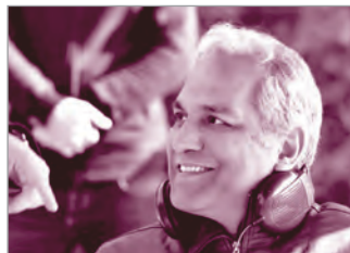
1. Mehran Modiri 4/7