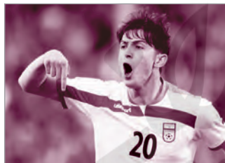
2. Sardar Azmoun 1/1